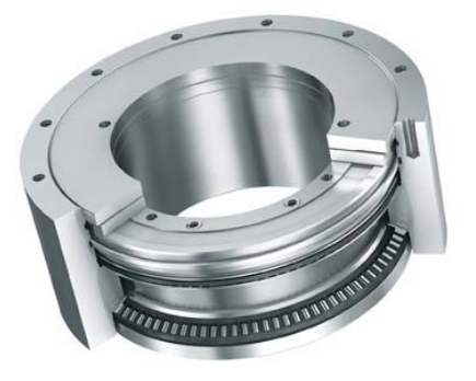
Bearing unit for operating room ceiling stands with electromagnetic brake

But mechatronic system integration is much more than just combining the best components to form a single unit. Correctly matching the individual parts to each other is decisive for achieving the overall functionality.