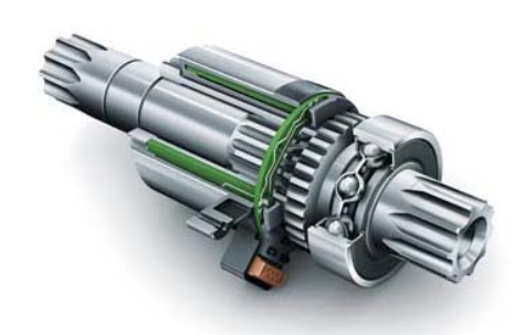
Smooth-running sensor bottom bracket, integrated into e-bike

Your contact in the Schaeffler Sales team and our mechatronics experts in application engineering will be pleased to discuss possible approaches for further optimizing mechatronic solutions in your application with you.